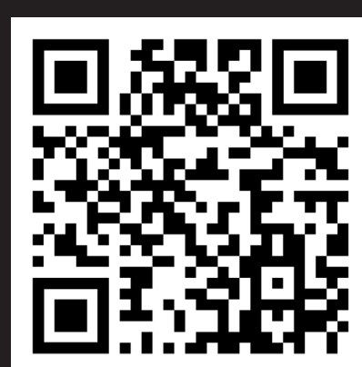
The One Choice 5